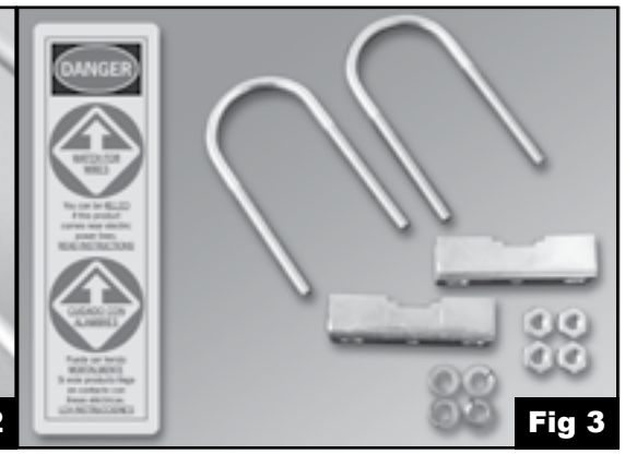
Included Hardware Material Incluido